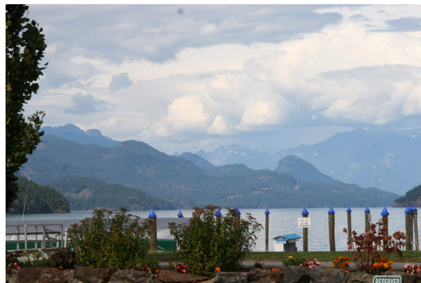
Harrison Lake, BC